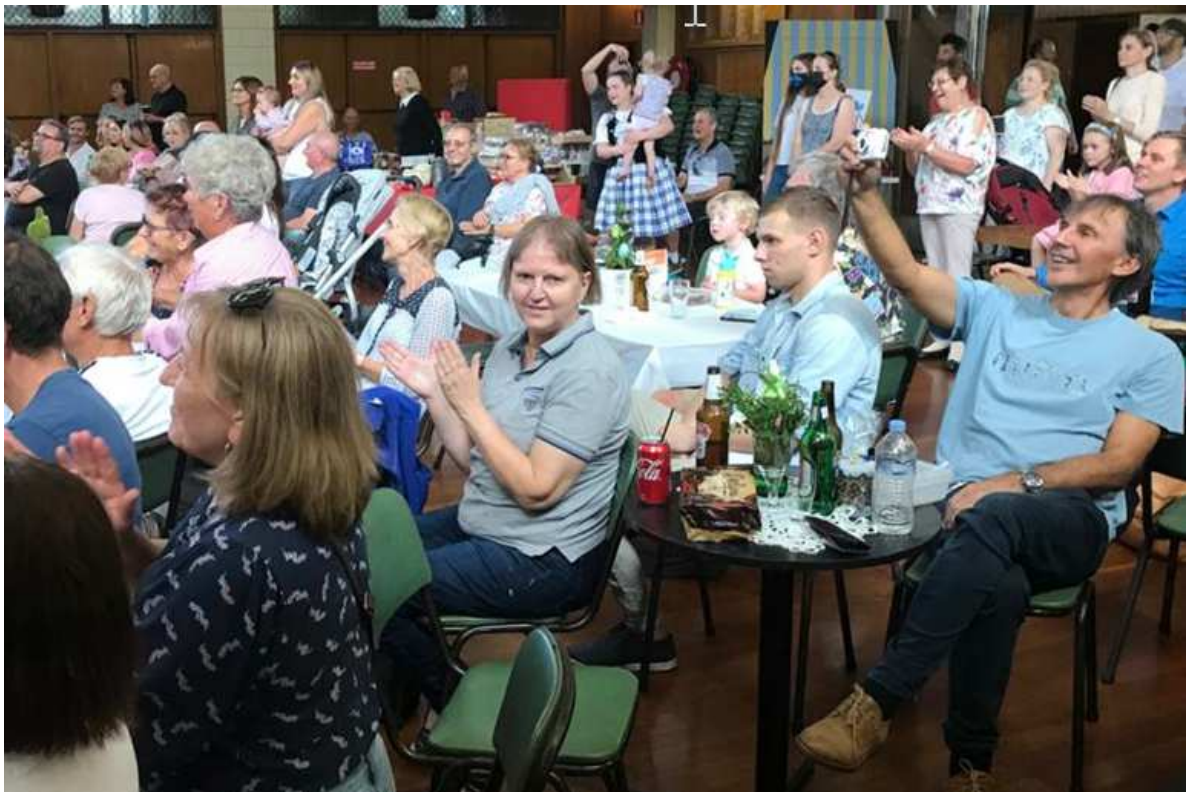
Some familiar faces