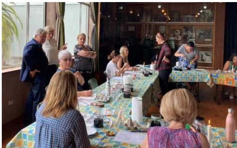
Our Consul getting ready to paint an egg – she created a diplomatic pisanka