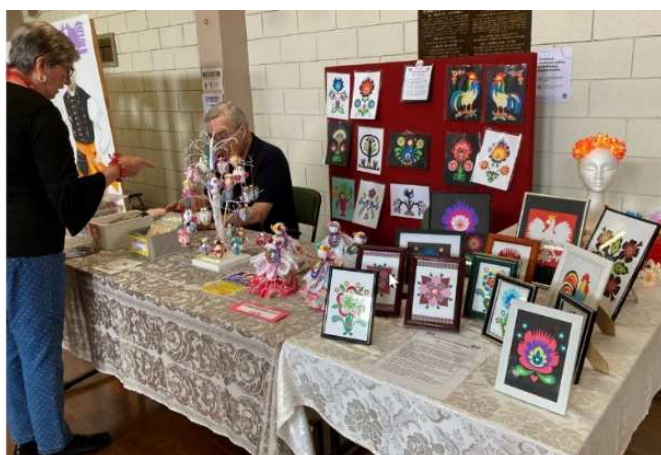
Display of traditional Polish wycinanki