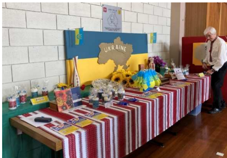
Ukrainian community display

As part of the festival, money was raised for UNICEF to assist children directly affected by the brutal Russian invasion of Ukrainian.