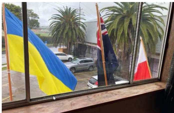
The national flags in front of the building on the rainy day