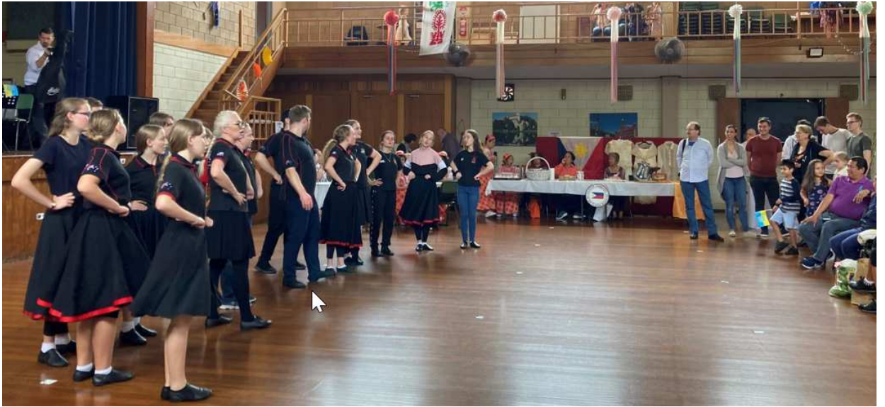
Lajkonik practicing before the performance was watched with interest