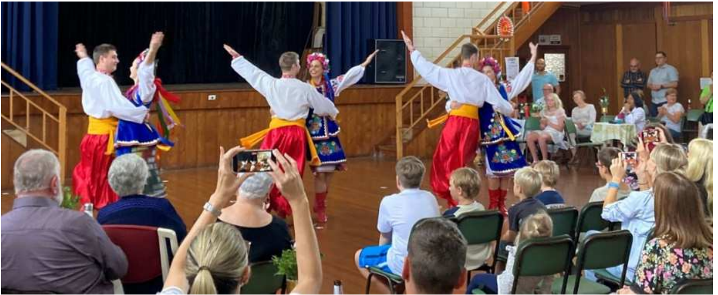
Ukrainian dance group (from Sydney) – impressive almost acrobatic performance