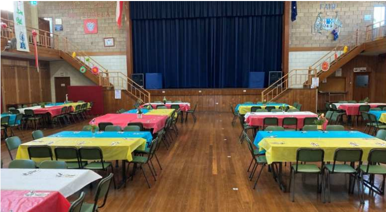
National colors of the tablecloths under Wiesiek's comands