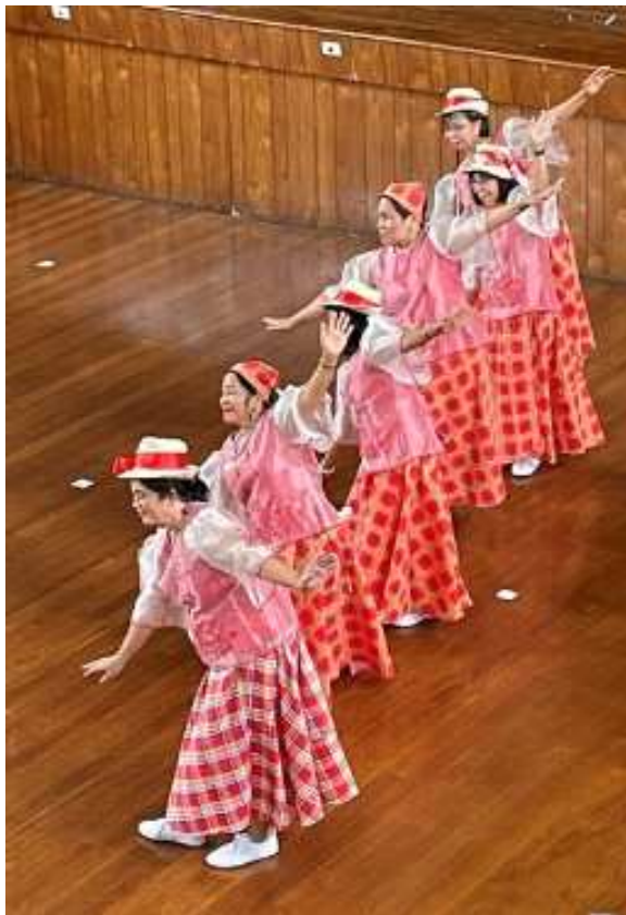
Filipino dancers – adding Asian spice