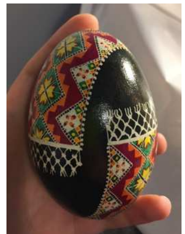
Display of Agata's pisanki – of which sale generated $700 for the charity