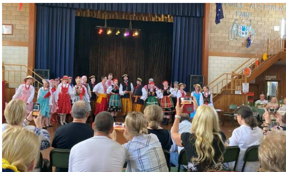
Of course, Lajkonik from Sydney. The group decimated by Covid but still magnificent