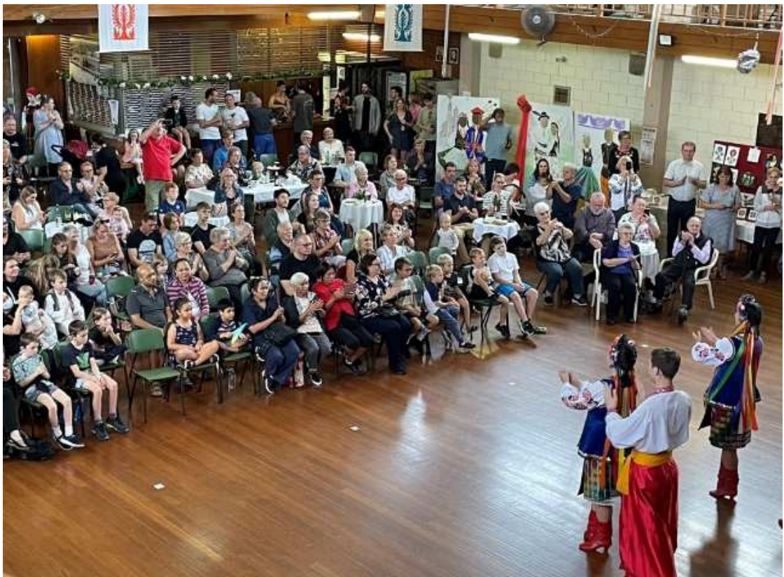
Loved by the audience