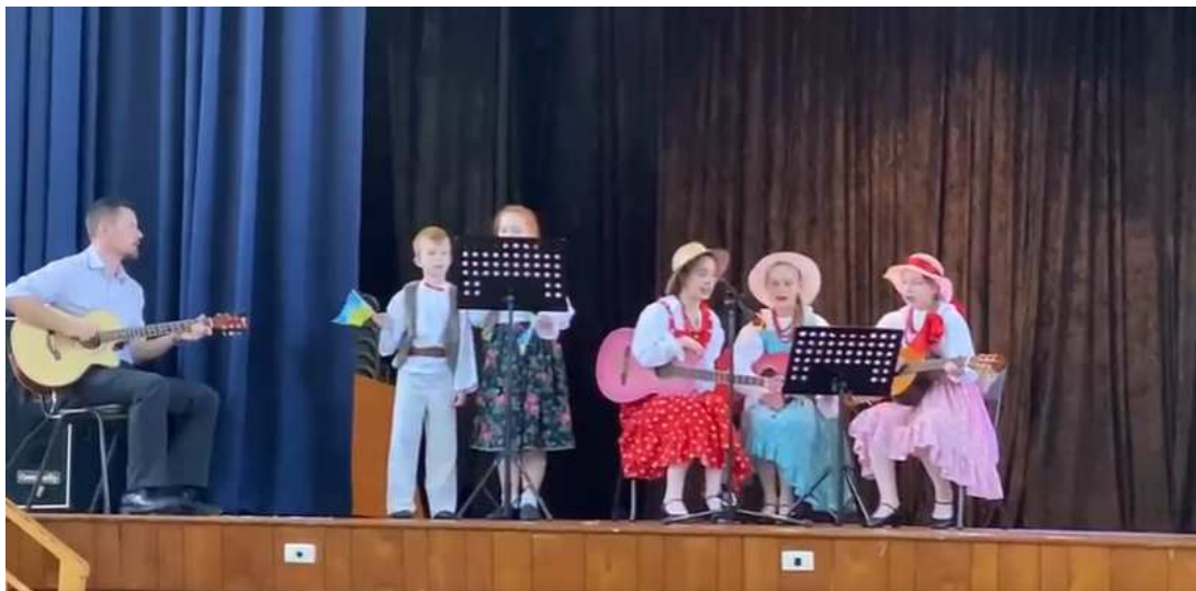
Talented Polish children have learnt to sing this song in Ukrainian