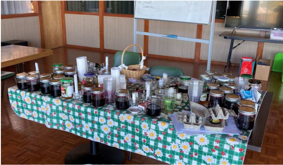
Leftovers from the egg decorating workshops