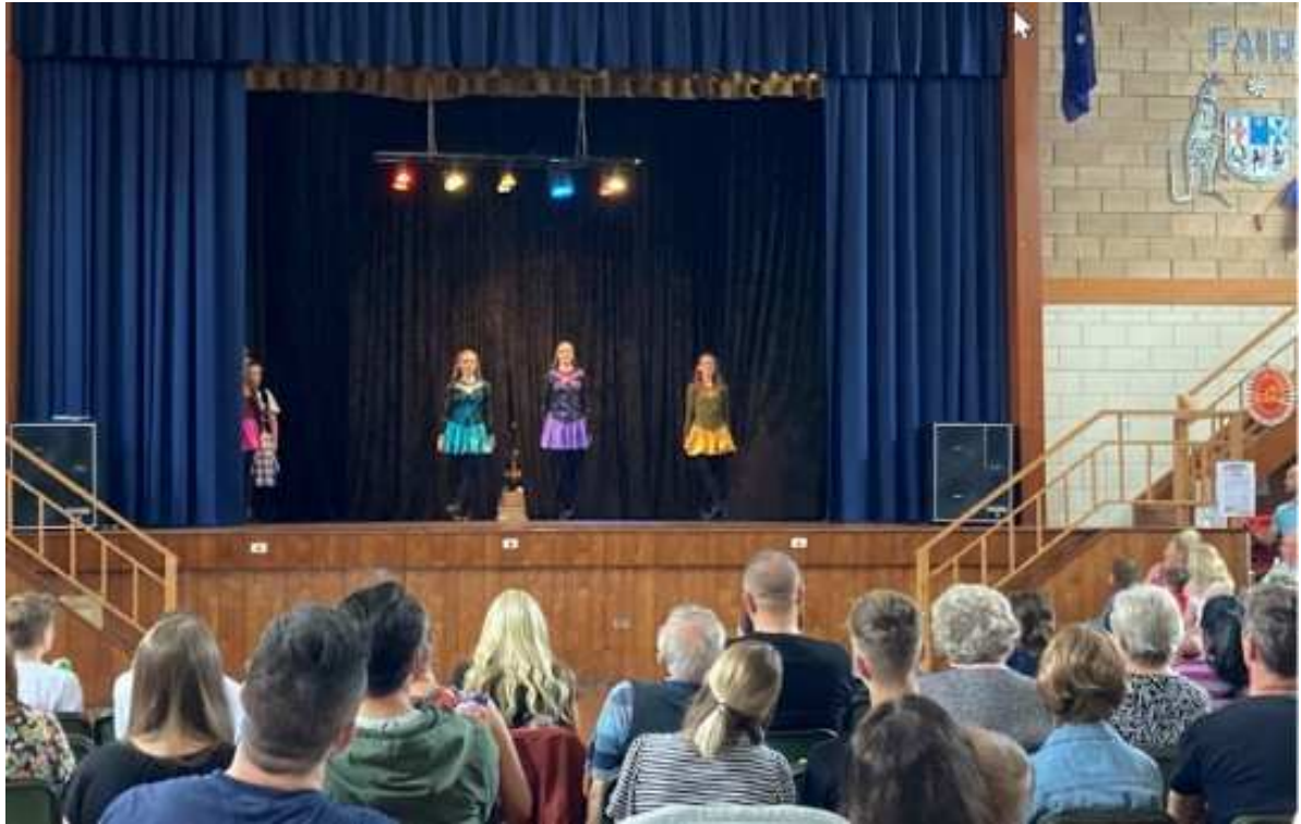
Irish dancers – what a rhythm! This group is practicing in the Polish House every Monday